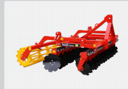
Texas Compact Disc Tiller