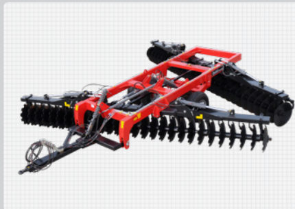
Megastar-K Folding Offset Discs