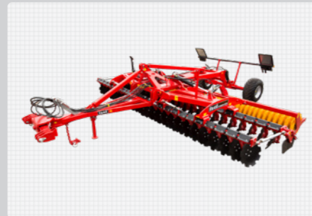
Aragon Trailing Folding Disc Tillers