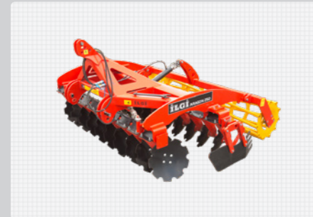
Aragon Linkage Rigid Disc Tillers