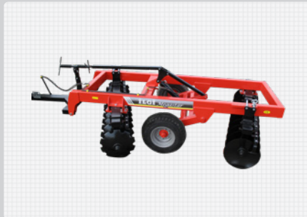
Megastar Rigid Offset Discs