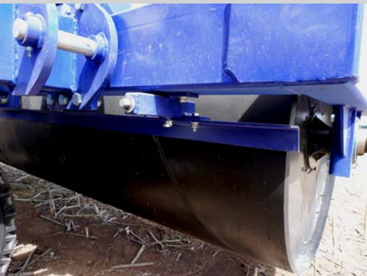
6. Adjustable Scrapers