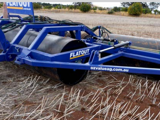
1. Hydraulic Locking Frame