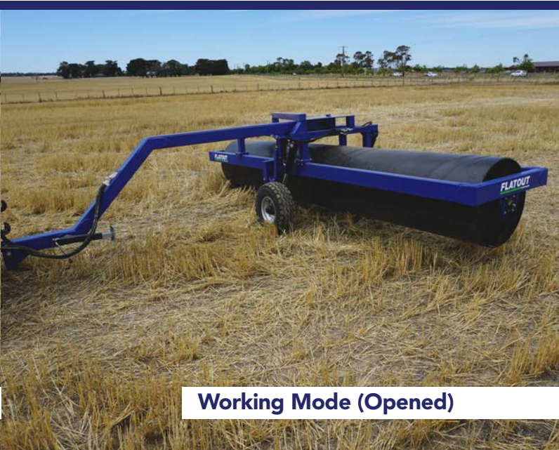
Working Mode (Opened)