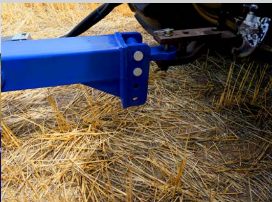
3. Adjustable Drawbar