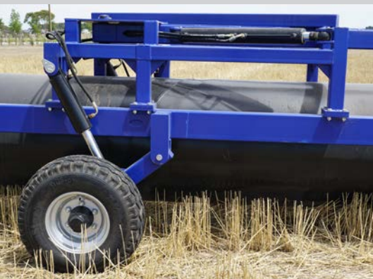
1. Hydraulic Transport Wheels