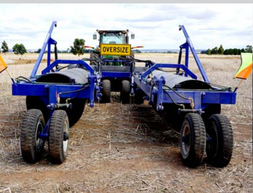
2. Narrow Transport Width