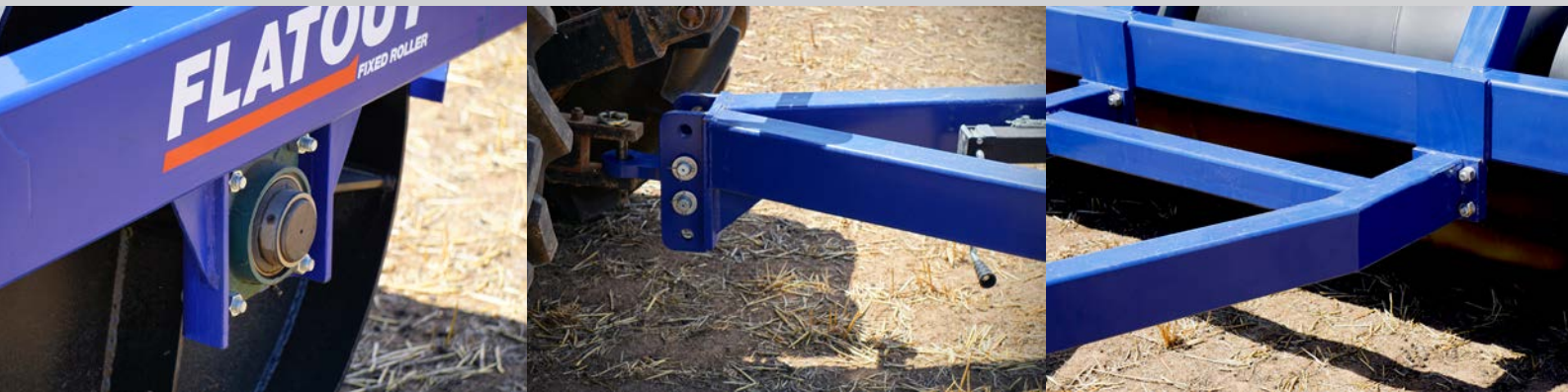
1. 75mm Bearings