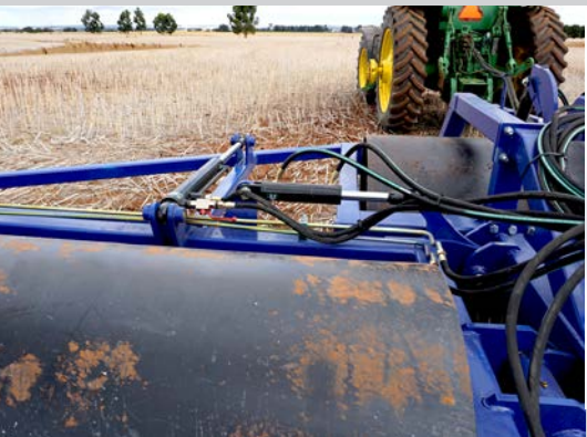
4. Twin Lock Mechanism