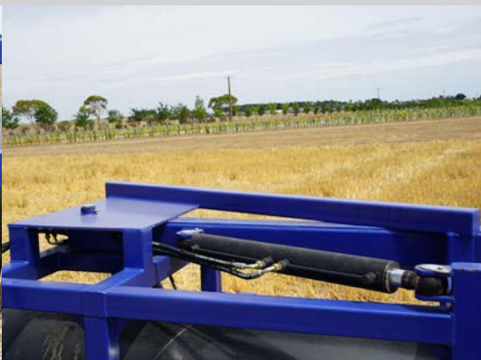
2. Hydraulic Drawbar Swivel