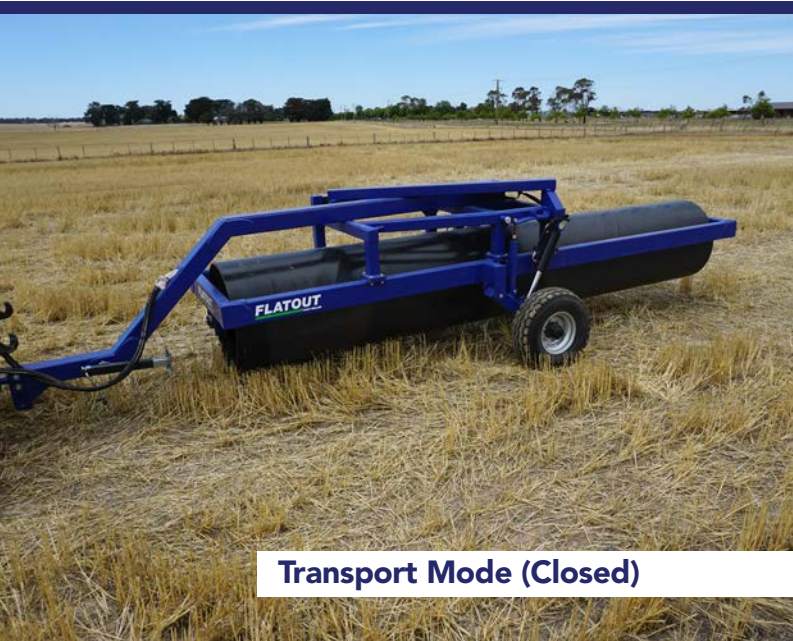
Transport Mode (Closed)