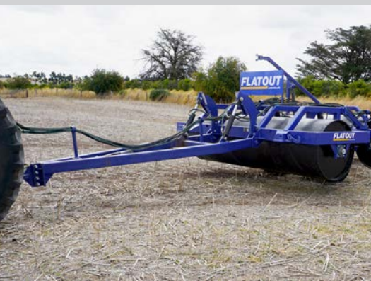
3. Floating Drawbar